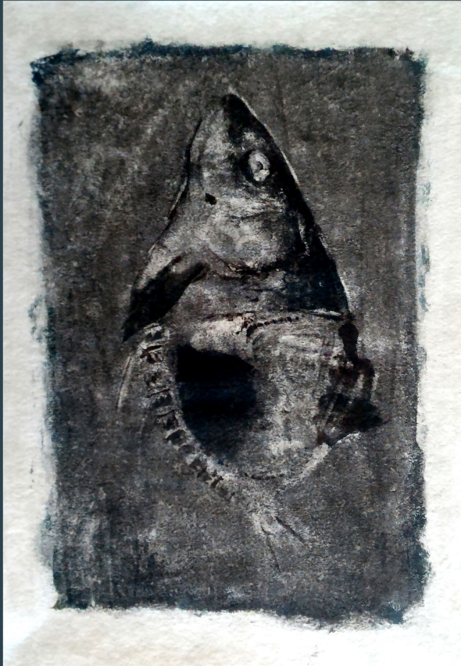
“Marine Elements” - 35x50 cm, Oilprint on watercolour paper, Constanța 2017