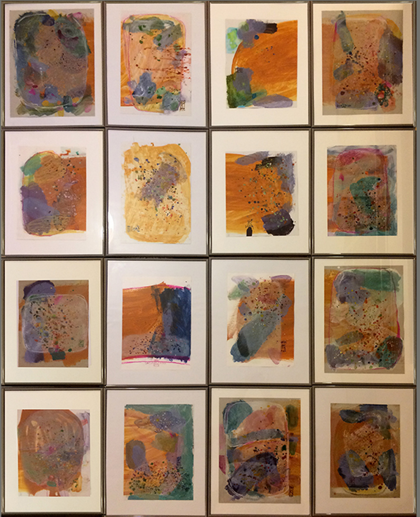
LELIA RUS PÎRVAN THE SEASHORE, MIX MEDIA, 2018